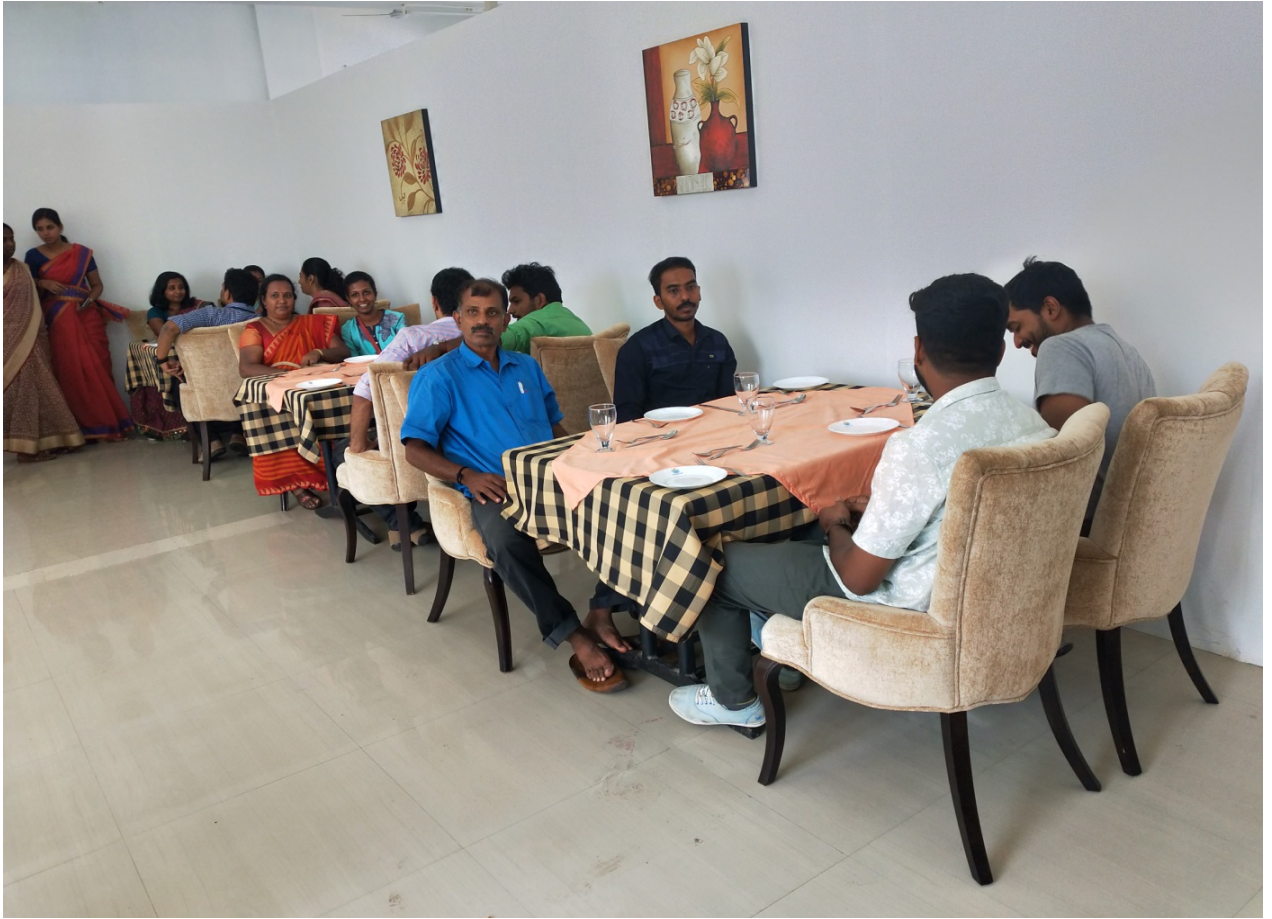
Front Office Lab